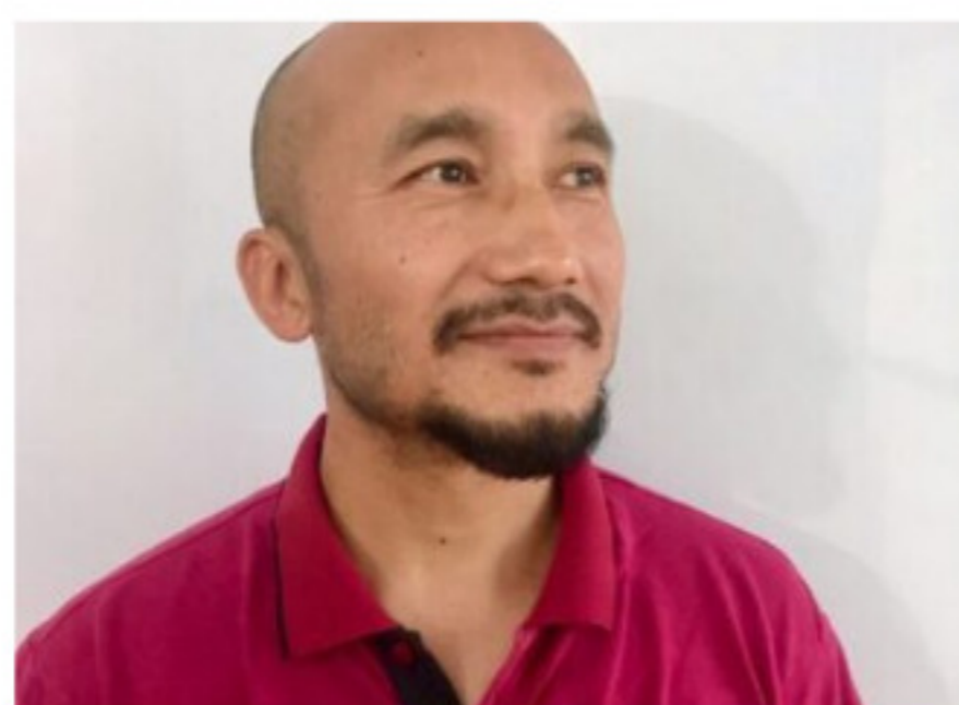
CHIJ BDR. LAMA COO